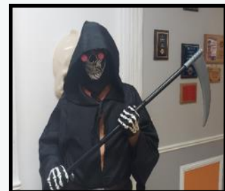
Scariest – Grim Reaper – AI