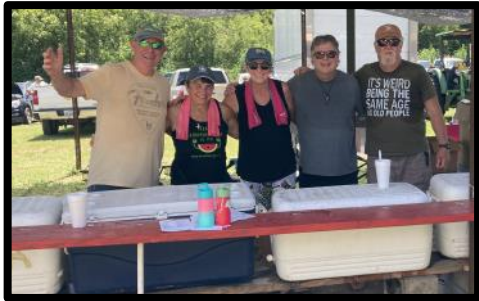
Sahnoan Crew represents at McDade Watermelon Festival.

I hope you've all recovered from a fun, but hot, day at the Watermelon Festival Beer Booth. It seems like everyone had a good time and represented Star Ranch in a very positive and productive way. I have been advised that through our sales of beer, soft drinks, water and koozies, we collected $4,587.00 for the Watermelon Festival and the good causes it supports.