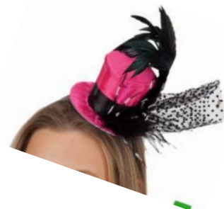
Kentucky Derby hat samples